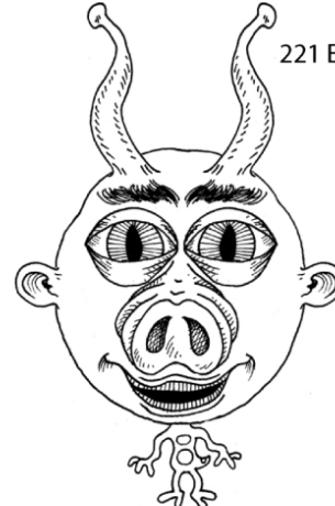
Wilma 221 Earth-years old