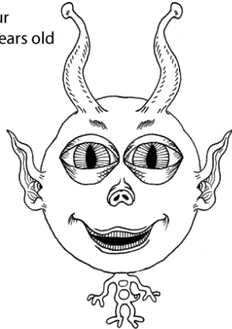
Wilbur 224 Earth-years old